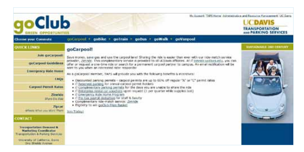
UC-Davis promotes its carpool program online.