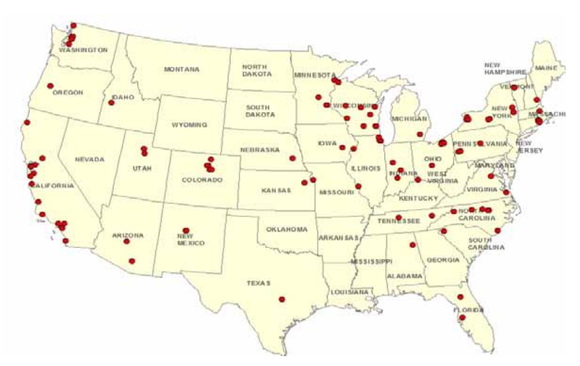
Figure 1. Colleges and Universities with U-Pass, Transit Discount or Fare-Free Transit Programs in the Conterminous United States<sup>21</sup>

Other colleges and universities augment local transit service by providing private, university-run shuttle buses. A