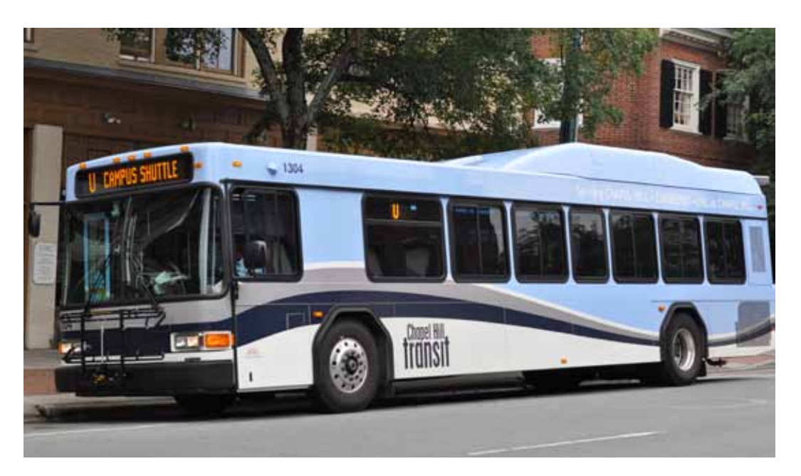
UNC partners with Chapel Hill Transit to provide fare-free service to the entire Chapel Hill community.

The university's decision to facilitate fare-free transit has also benefited the entire Chapel Hill community. Between 2001 and 2011 (the most recent year for which data are available), ridership on the local bus system surged