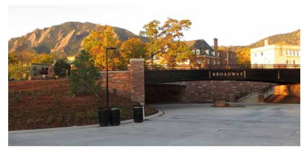
Pedestrian and bicycle underpass at Broadway bordering the CU-Boulder campus.

enough for roughly one-third of students to ride to school.<sup>71</sup> Coupled with the university's investments in city underpasses, these infrastructural improvements provide both the connections to the surrounding city and the campus capacity to support the widespread use of bicycles as a means of getting around. In 2012 approximately 60 percent of all trips made by students at CU-Boulder were by bike or foot, a nearly nine percentage point increase over 1990.<sup>72</sup>